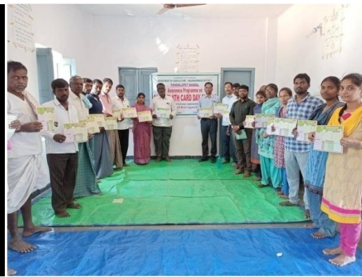
Soil health card distribution